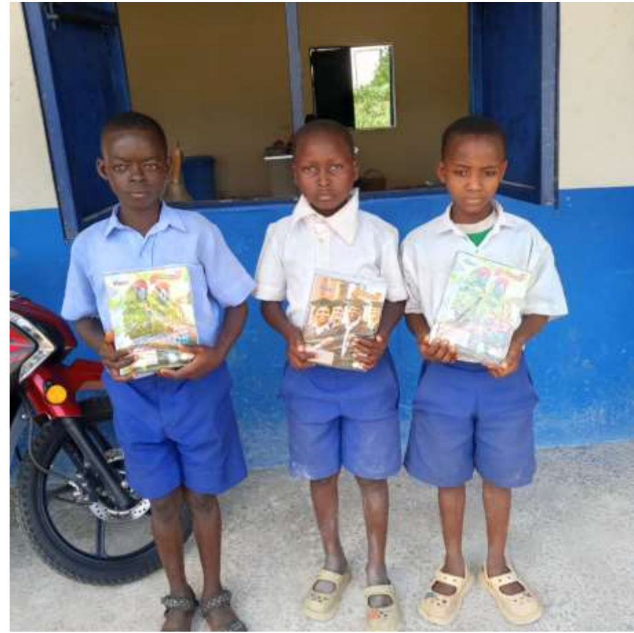
BENEFICIARIES OF SAC PROJECT INITIATIVE IN GOVERNMENT PRIMARY SCHOOL UDIGIE, CROSS RIVER STATE WITH KRCF AFTER RECEIVING THEIR EDUCATIONAL MATERIALS AND PAYMENT OF THEIR SCHOOL FEES AND OTHER SCHOOL CHARGES IN OCTOBER 2025 FOR 2025/2926 ACADEMIC SESSION.