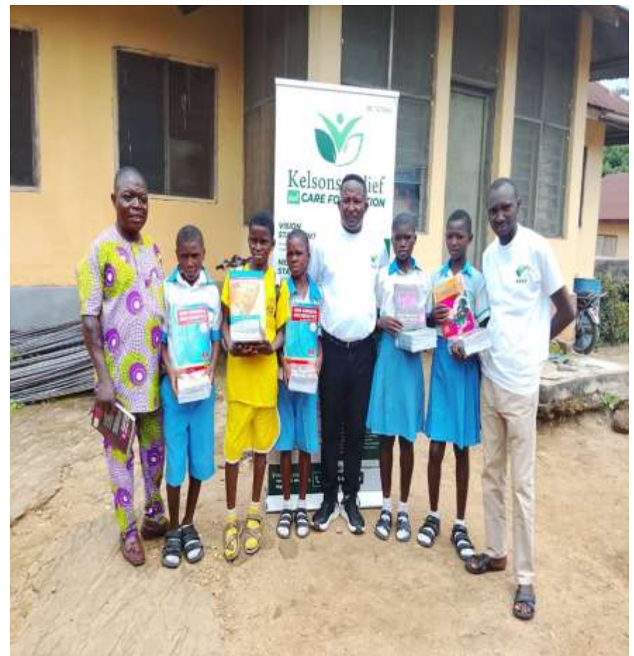
BENEFICIARIES OF SAC PROJECT INITIATIVE IN GODBEY SECONDARY COMMERCIAL SCHOOL OBANLINKU, CROSS RIVER STATE WITH KRCF AFTER RECEIVING THEIR EDUCATIONAL MATERIALS AND PAYMENT OF THEIR SCHOOL FEES AND OTHER SCHOOL CHARGES IN OCTOBER 2025 FOR 2025/2026 ACADEMIC SESSION.