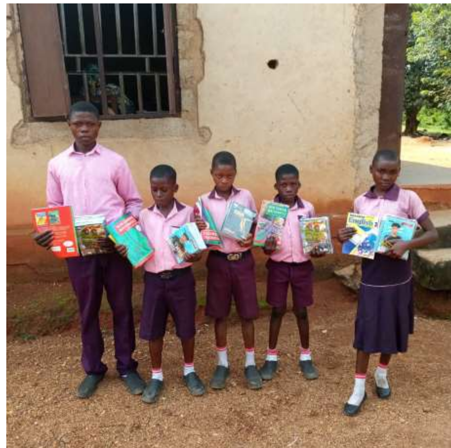
BENEFICIARIES OF SAC PROJECT INITIATIVE IN COMMUNITY SECONDARY SCHOOL BEBUAWHAN, CROSS RIVER STATE WITH KRCF AFTER RECEIVING THEIR EDUCATIONAL MATERIALS AND PAYMENT OF THEIR SCHOOL FEES AND OTHER SCHOOL CHARGES IN OCTOBER 2025 FOR 2025/2026 ACADEMIC SESSION.