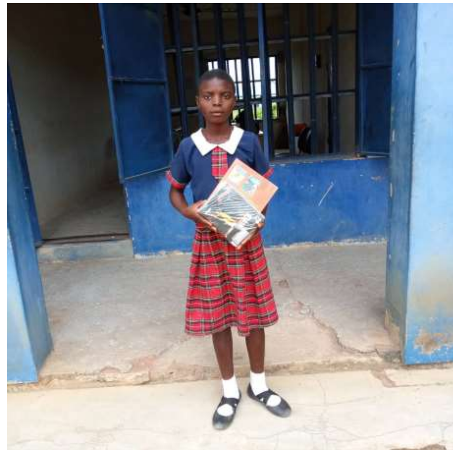
BENEFICIARIES OF SAC PROJECT INITIATIVE IN GIRLS SECONDARY SCHOOL OBUDU, CROSS RIVER STATE WITH KRCF AFTER RECEIVING THEIR EDUCATIONAL MATERIALS AND PAYMENT OF THEIR SCHOOL FEES AND OTHER SCHOOL CHARGES IN OCTOBER 2025 FOR 2025/2026 ACADEMIC SESSION.