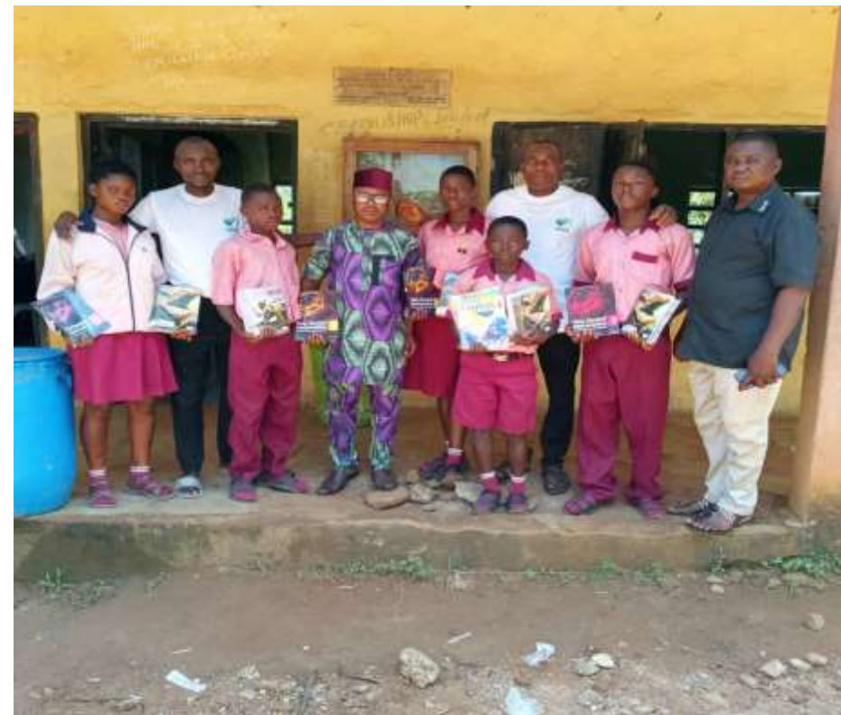
BENEFICIARIES OF SAC PROJECT INITIATIVE IN BOKI SECONDARY SCHOOL, CROSS RIVER STATE WITH KRCF AFTER RECEIVING THEIR EDUCATIONAL MATERIALS AND PAYMENT OF THEIR SCHOOL FEES AND OTHER SCHOOL CHARGES IN OCTOBER 2025 FOR 2025/2026 ACADEMIC SESSION.