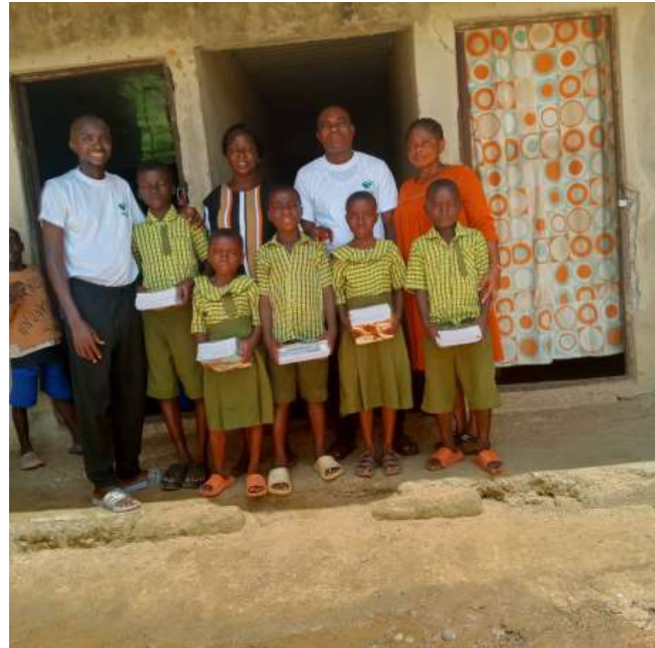
BENEFICIARIES OF SAC PROJECT INITIATIVE IN GOVERNMENT PRIMARY SCHOOL BOKI, CROSS RIVER STATE WITH KRCF AFTER RECEIVING THEIR EDUCATIONAL MATERIALS AND PAYMENT OF THEIR SCHOOL FEES AND OTHER SCHOOL CHARGES IN OCTOBER 2025 FOR 2025/2026 ACADEMIC SESSION.